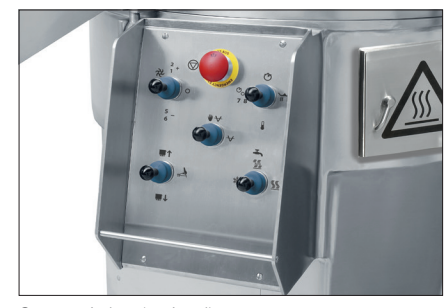
Cross switches (optional)