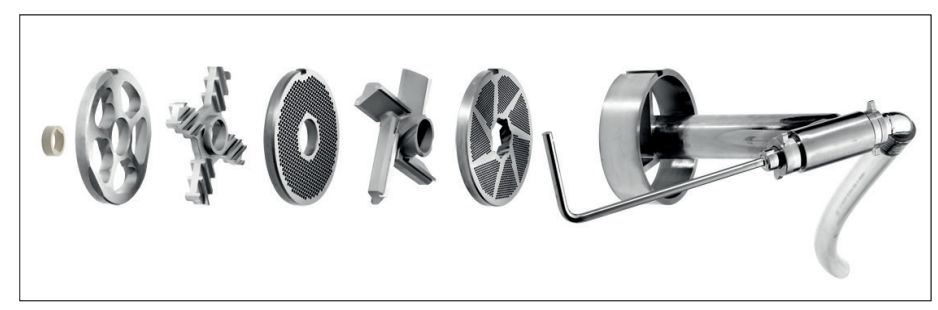
Separating set (optional)