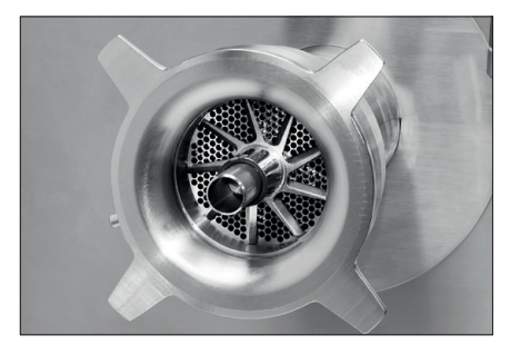
Outside knife (optional)