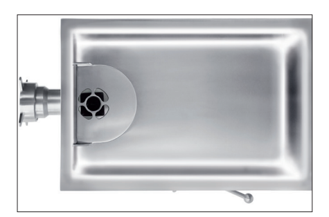
Top view: Hopper