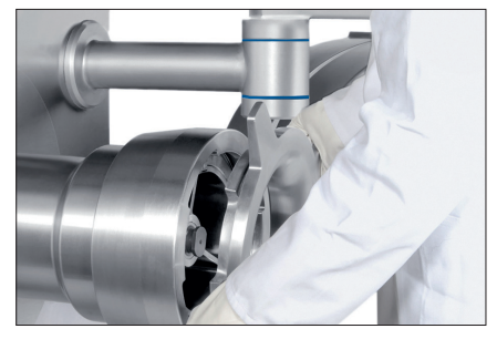
Bayonet locking (optional)